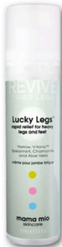
Mama Mio Lucky Legs Cooling Serum

Powder Lift is a dream come true for fine-haired babes like myself. You shake out this very finely milled powder that's made from aloe, silica, panthenol, and soy protein into your hand. A little goes a long way! It has a cooling feeling on contact, and you can either rake it through your hair with your fingers, or sprinkle it directly on your roots for INSTANT lift and volume. Another feature of this miracle product is that you can add it to other styling products—like mousse or gel, for added oomph! ( eufora.net for locations)